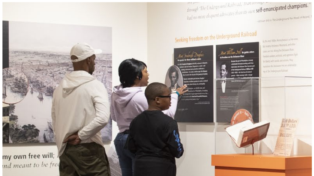
The exhibit, Tides of Freedom: African Presence on the Delaware River explores the concept of freedom through the lens of the African experience along the Delaware.