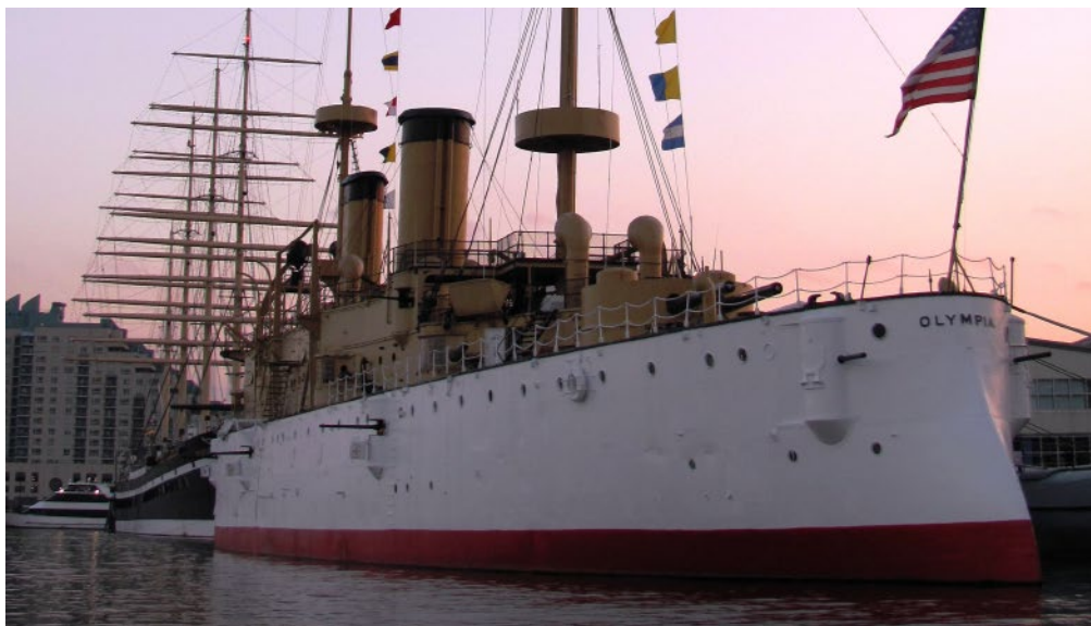
Cruiser Olympia , commissioned in 1895, is the oldest remaining steel ship afloat.

Cruiser Olympia, River Alive!, and Tides of Freedom